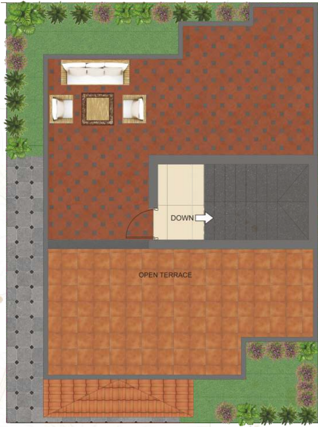
Villa A to E (TF)