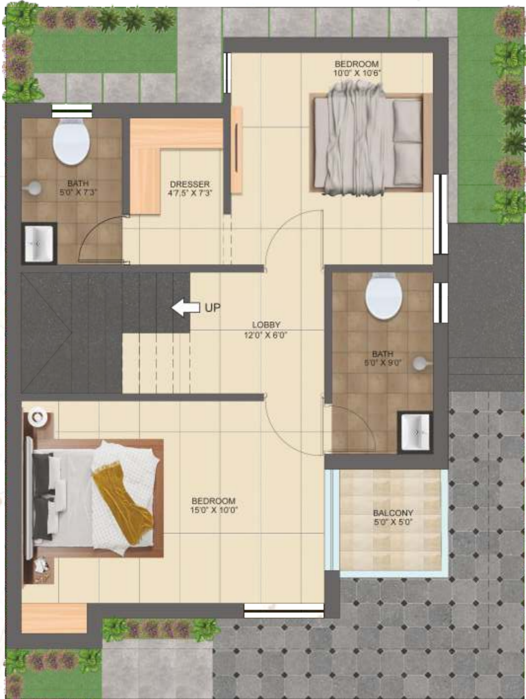
Villa F to J (FF)