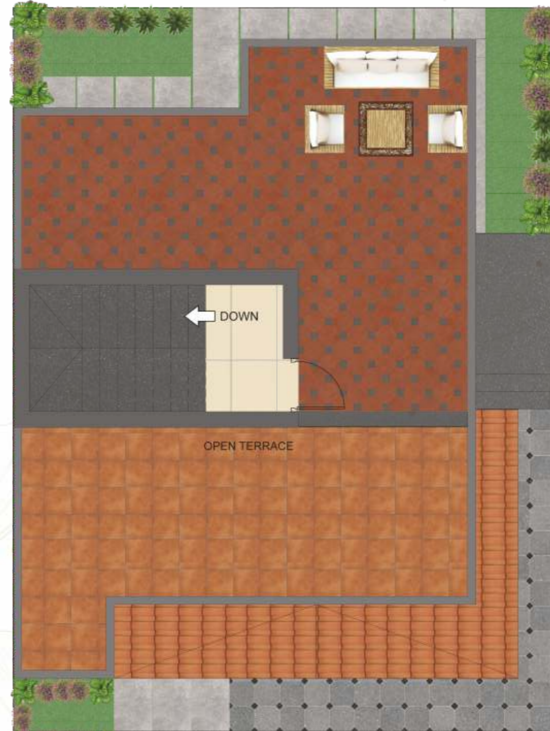
Villa F to J (TF)