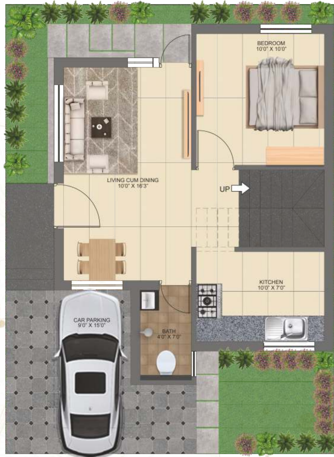
Villa A to E (GF)