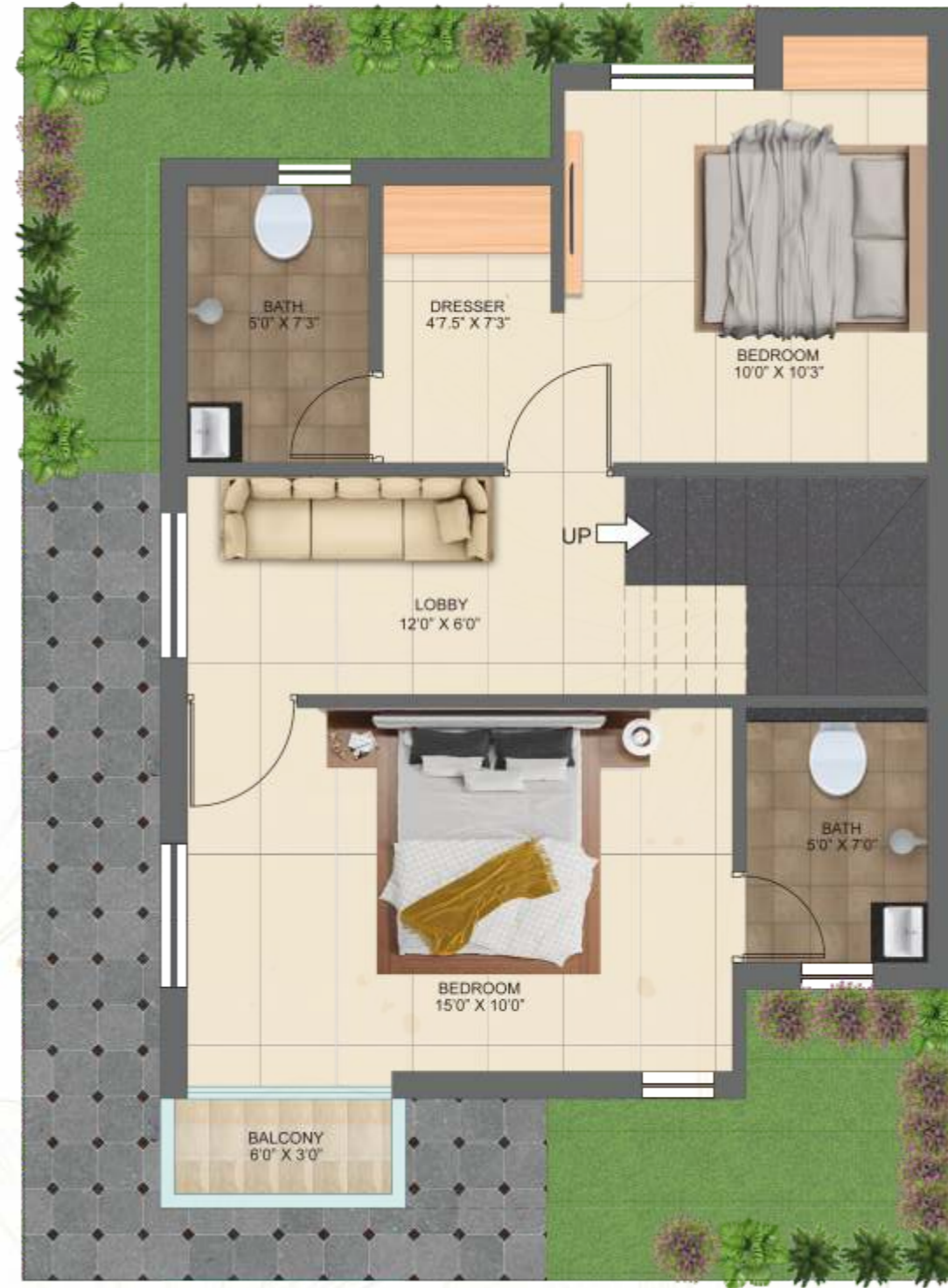
Villa A to E (FF)