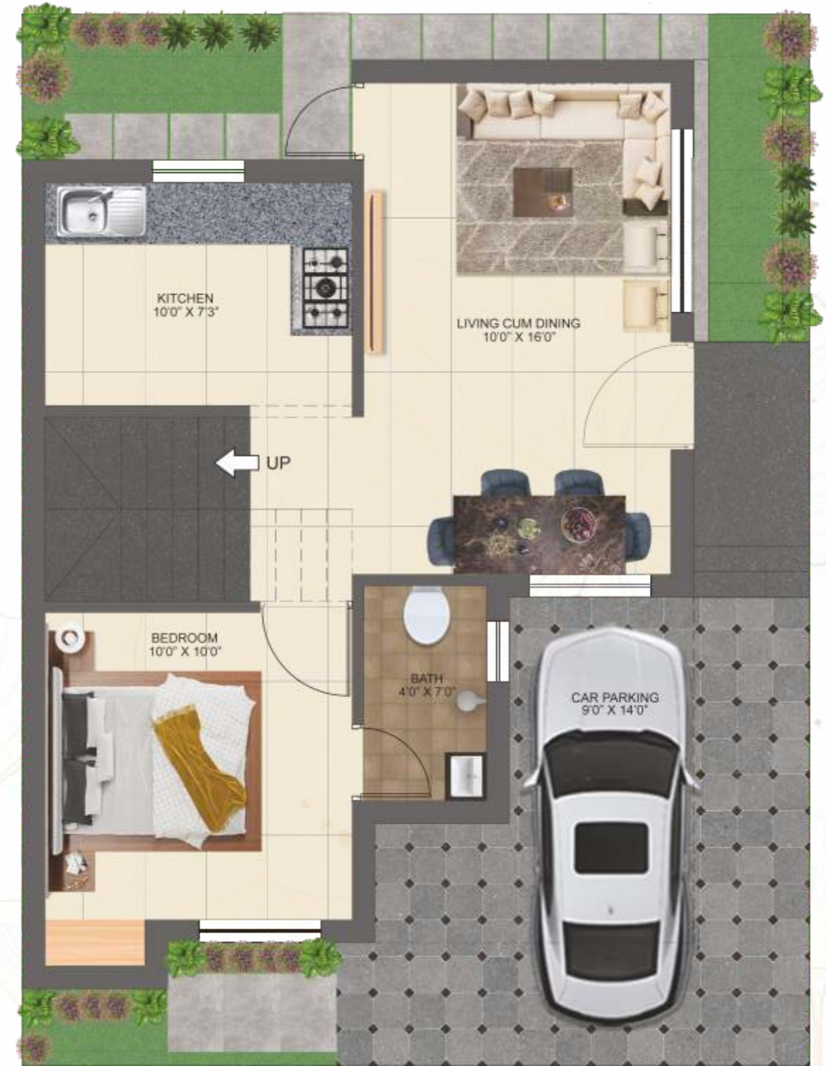
Villa F to J (GF)