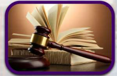
PERFECT LEGAL DOCUMENTATION