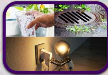
ESSENTIAL AMENITIES PROVISIONS LIKE WATER DRAINAGE, ELECTRICITY ETC.,