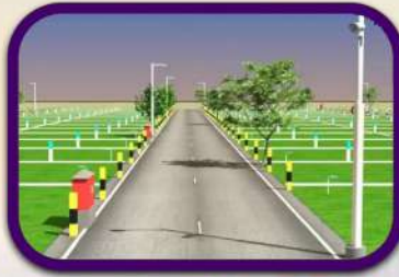
WELL- LAID BLACKTOP INTERNAL ROADS WITH STREET LIGHTS