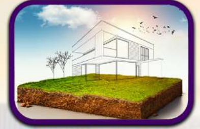
READY TO CONSTRUCT VILLA PLOTS