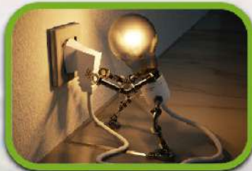
PROVISIONS FOR EB POWER SUPPLY