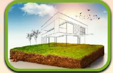
READY TO CONSTRUCT VILLA PLOTS