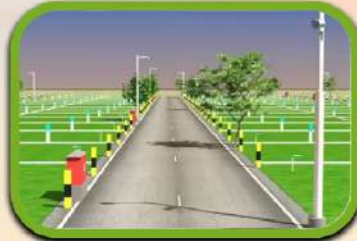
WELL- LAID BLACKTOP INTERNAL ROADS WITH STREET LIGHTS