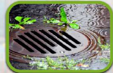
PROVISIONS FOR DRAINAGE SYSTEM