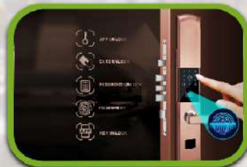
MAIN DOOR 5 WAY SMART LOCK