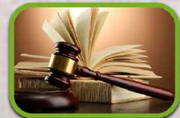
PERFECT LEGAL DOCUMENTATION