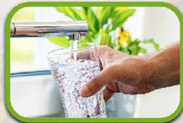
PROVISIONS FOR WATER SUPPLY